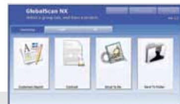
GlobalScan NX Project based scanning meets the needs of different business documents