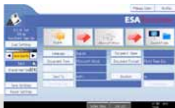
ESA Transformer Graphical icons for ease of use